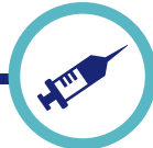
Type 1 Diabetes